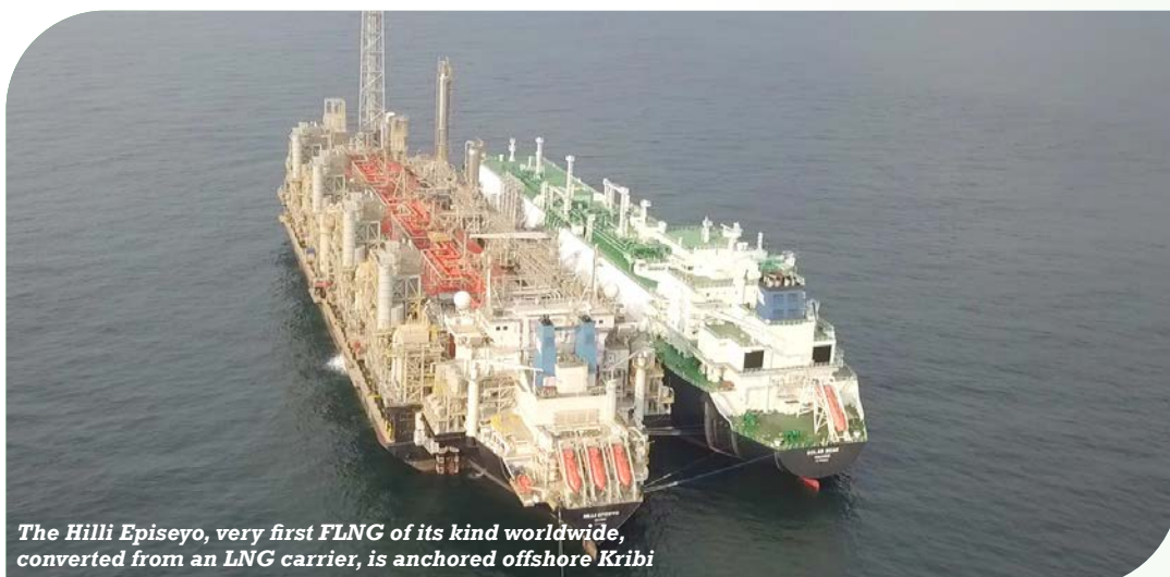
The Hilli Episeyo, very first FLNG of its kind worldwide, converted from an LNG carrier, is anchored offshore Kribi

A second project is underway to develop the Yoyo/Yolanda cross-border gas field in partnership with Chevron and the government of Equatorial Guinea.