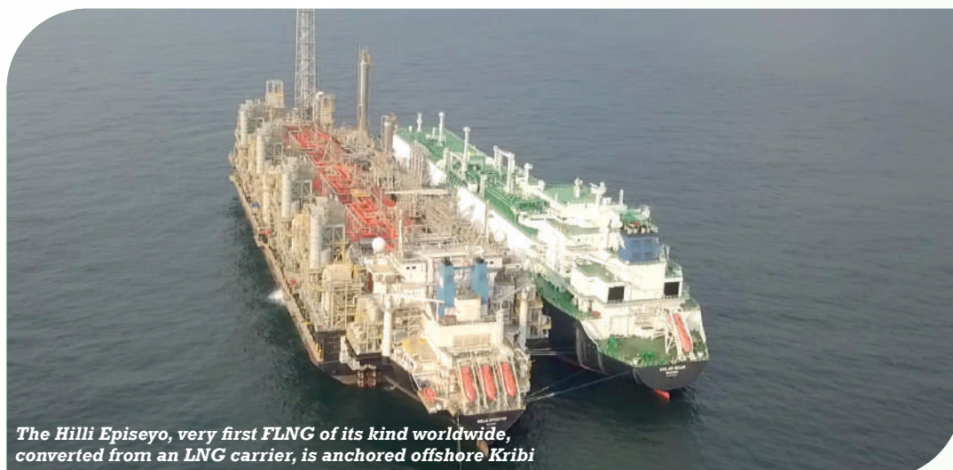
The Hilli Episeyo, very first FLNG of its kind worldwide, converted from an LNG carrier, is anchored offshore Kribi

A second project is underway to develop the Yoyo/Yolanda cross-border gas field in partnership with Chevron and the government of Equatorial Guinea.